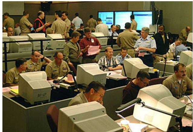
Figure 2: CommandNet use with the Coalition Joint Task Force

The Global 2001 War Game is one of the worlds largest with 400 participants from all-military services, government officials, and knowledgeable civilians from Canada, United Kingdom, Australia and the United States. When the game begins the participants are presented a scenario, tool sets to work the crisis, and are asked to observe, orient, decide, and act given the environment and forces at hand. At various waypoints the game is stopped for evaluation and discussion to facilitate learning.